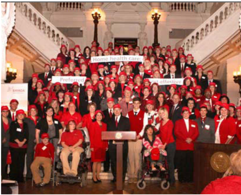
More than 160 BAYADA employees unite at the state capitol building in Harrisburg, PA, as part of the fifth annual legislative BAYADA Day.

As home health care professionals, it is important to us that our clients and their families live their lives to the fullest, with a sense of well-being, dignity, and trust. Many of our clients are faced with complex medical and psychosocial challenges, and they cannot experience a better quality of life without a strong, collective commitment from us to work together as a team. We feel we can accomplish significantly more on behalf of our clients as a unified group than we can as individuals, and we believe it is our responsibility to do so. At BAYADA, we are