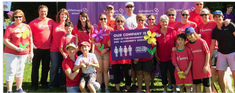
BAYADA 2017 Upper Valley, VT Team